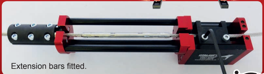
Extension bars fitted.

Note: This kit requires a Model 2000 Medium Duty tester with minimum 0-25kN gauge to operate.